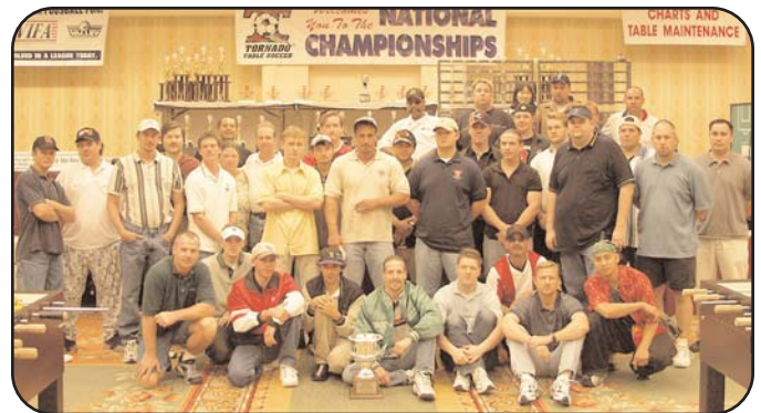
Pro Masters Group Shot